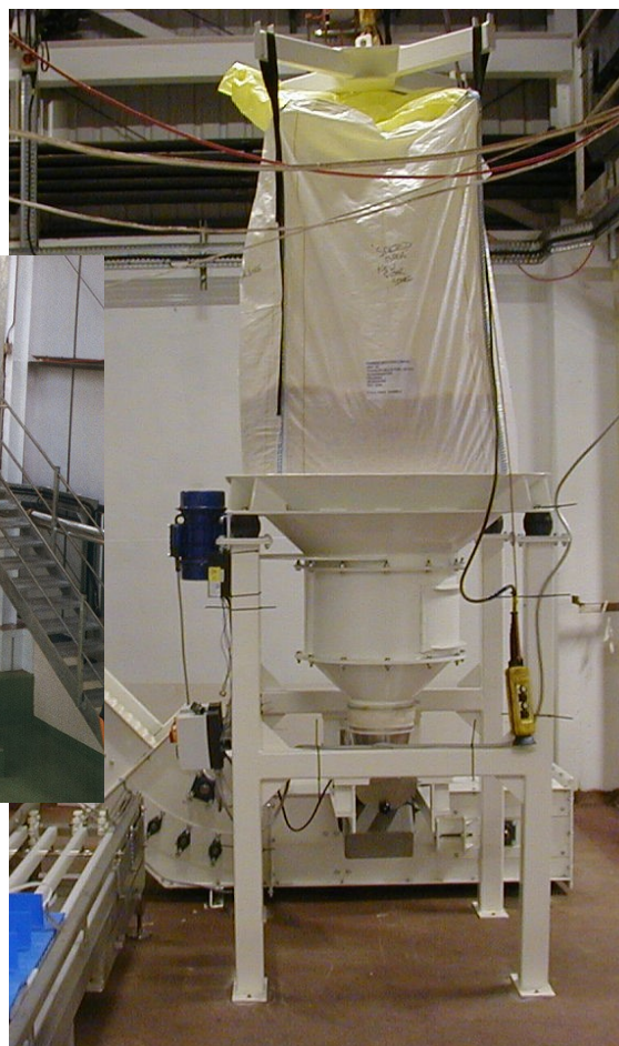
Big-bag discharge stations

Available in mild steel epoxy painted or 304/316 stainless steel construction