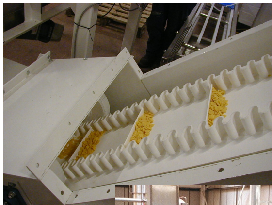
Edged wall belt conveyor for conveying flakes prior to coating