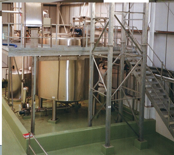
Blending plant for citric acid, used for CIP purposes