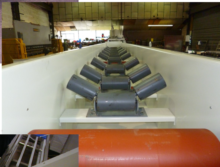
Roller troughs fitted inside an enclosed belt conveyor casing section