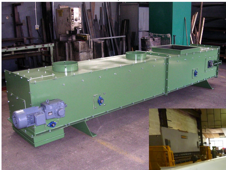
Enclosed belt conveyor awaiting inspection