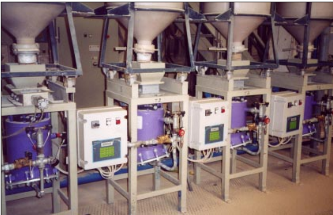
Four units conveying ceramic powder