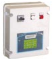
Microprocessor Control Panel